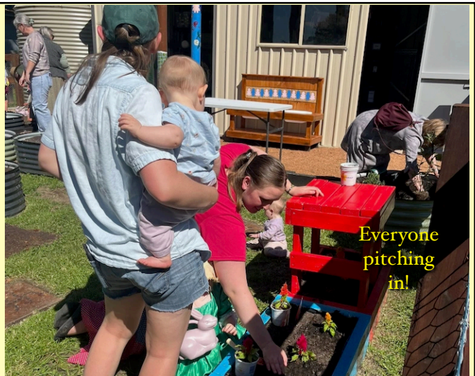
Everyone pitching in!

The Grand Opening of the Wingello Community Garden went very well on 8 April. Dignitaries from all the organisations that assisted in the construction were present and the weather was perfect. Of course, being a community garden, all those attending joined in and did some planting and testing out the excellent facilities. Many of the flowers and other plants are already sprouting very happily. The Wingello Growing Club is growing with locals sharing tips and companionship while improving Wingello's gardening knowledge.