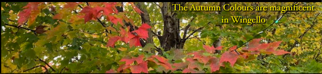
The Autumn Colours are magnificent in Wingello