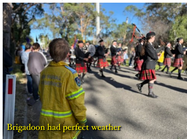
Brigadoon had perfect weather