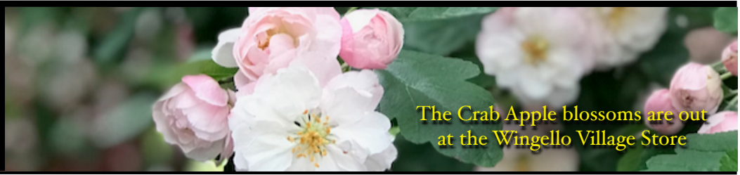
The Crab Apple blossoms are out at the Wingello Village Store