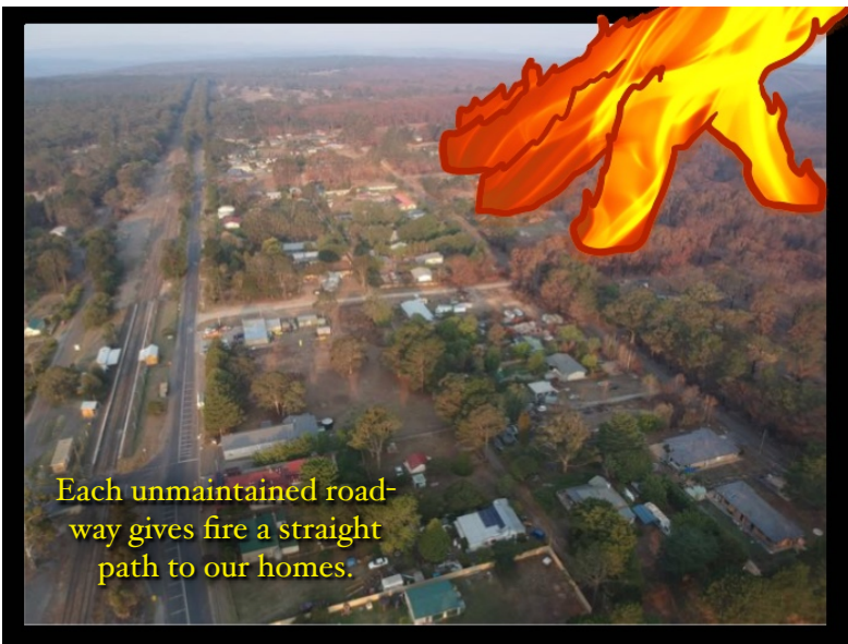
Each unmaintained roadway gives fire a straight path to our homes.

Look around your home now and think what would burn. Then mow the grass, remove overgrown plants near the house, trim and cut back dead wood and more. Move the firewood away from the house. Houses that were prepared were NOT as badly impacted by the 2020 fires. Many homes were saved because the fire couldn't get close enough.