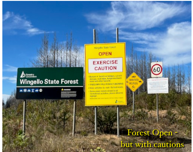
Forest Open - but with cautions

Finally the trucks were able to get back in and clear most of the burnt and dead trees. Most of the State Forest is Pine trees, and these trees do not like fire. Add in a waterlogged ground and many of the trees died as they stood. On windy days locals living nearby can hear one tree fall, followed by a domino effect of others being pushed over by the first.