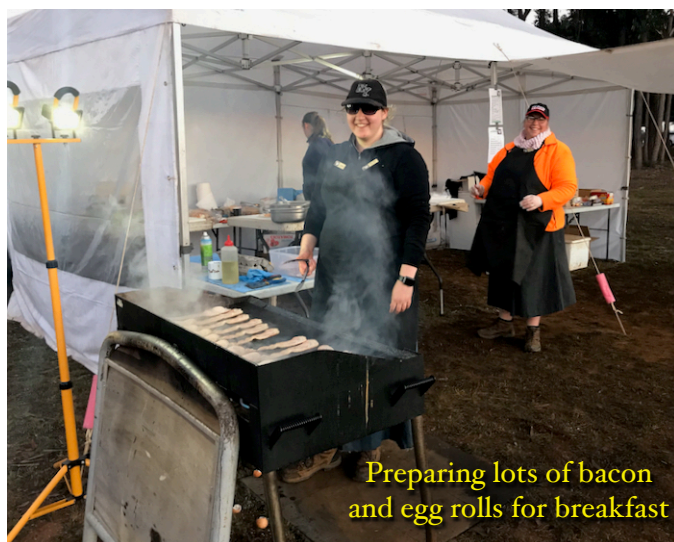
Preparing lots of bacon and egg rolls for breakfast

For more information, you can pick up a flyer at your local village store, visit the website www.highland-endurance.com , or find us on Facebook/Instagram #wingelloforestenduranceride.