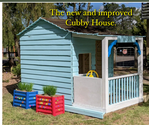
Information provided by Wingello School Parents

The children are loving their new playground, and are looking forward to an exciting term two!