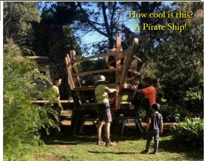
How cool is this? A Pirate Ship!

We would like to wish all in our community continued good health during these unprecedented times.