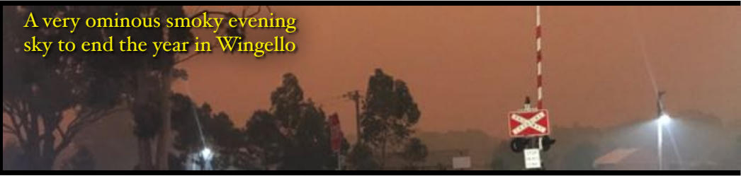
A very ominous smoky evening sky to end the year in Wingello