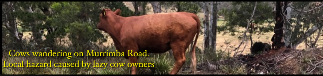
Cows wandering on Murrimba Road. Local hazard caused by lazy cow owners