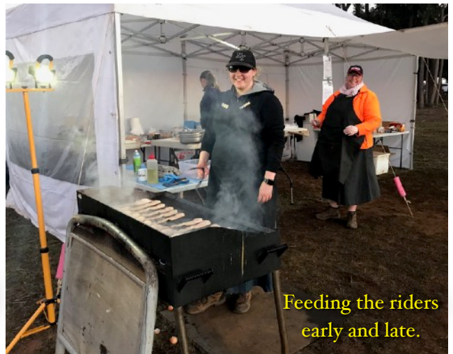
Feeding the riders early and late.