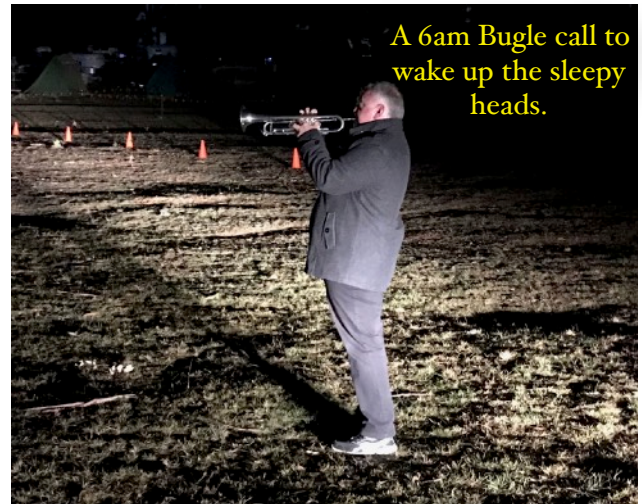
A 6am Bugle call to wake up the sleepy heads.

On Sunday morning, a quite skilled bugler spread the news that it was time to wake up for all those who were still asleep. Most riders, however, had already woken up