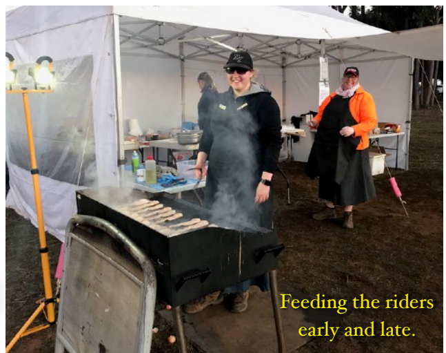
Feeding the riders early and late.