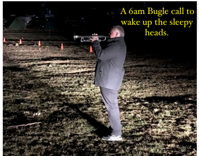
A 6am Bugle call to wake up the sleepy heads.

On Sunday morning, a quite skilled bugler spread the news that it was time to wake up for all those who were still asleep. Most riders, however, had already woken up