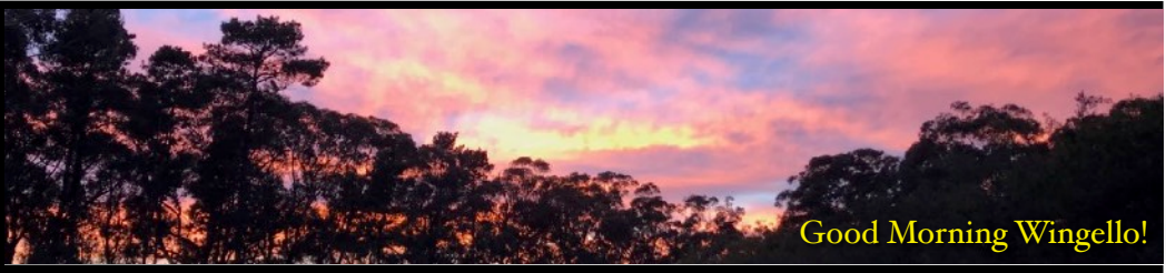
Good Morning Wingello!