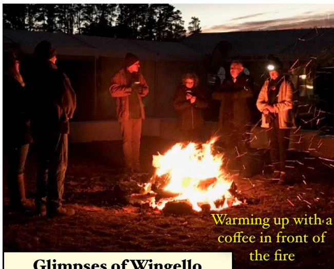
Warming up with a coffee in front of the fire

some time earlier to get ready for the 7am start of the 40km and 80km rides. We were there getting ready to feed the early risers. Brrrr. It was quite chilly!