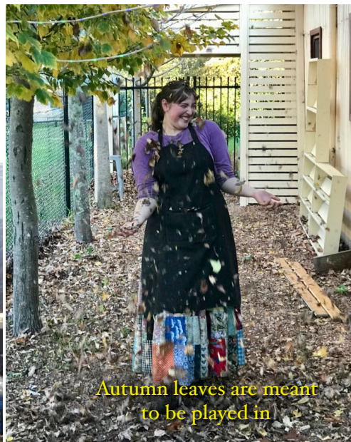
Autumn leaves are meant to be played in

Includes hot savoury supper. BYO drinks.