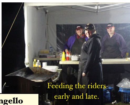
Feeding the riders early and late.

For more information, pick up a brochure at your local village store, visit the website www.highlandsendurance.com