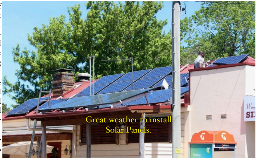
Great weather to install Solar Panels.

If a battery was put into the system, the power generated would first get used and any excess would go in to the battery. If the battery was full then the excess would go to the Grid. Power usage would come from the Solar Panels, and if that