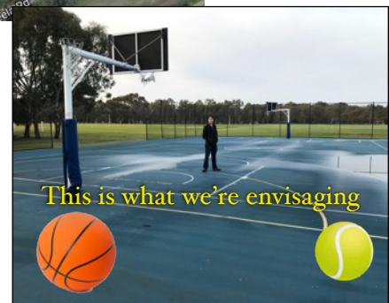
This is what we're envisaging