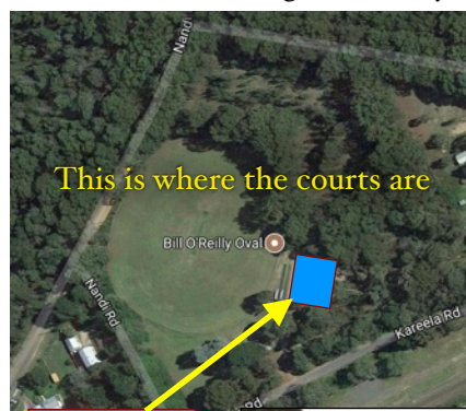
This is where the courts are

sports will be able to make use of the grounds as well as bikes, scooters and other wheeled devices for which there is nowhere safe in Wingello to ride.