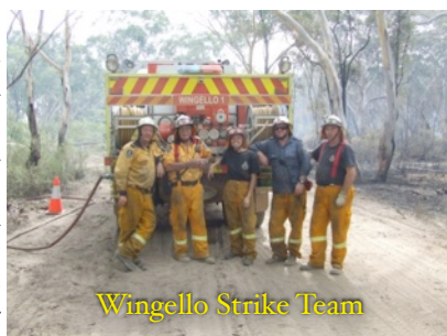
Wingello Strike Team

Wingello Brigade had five members who were part of the five day Strike team from the Southern Highlands sent to Coonabarabran area for the Sir Ivan fire where over 55,372 hectares of farm land there was burnt out, 35 houses destroyed and another 11 damaged, along with 131 other buildings. Livestock lost was over 5,056 and over