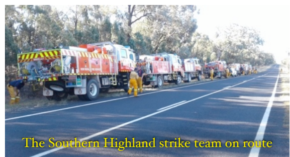
The Southern Highland strike team on route

So a busy month let's hope March is a little quieter. In the meantime be prepared and stay safe.