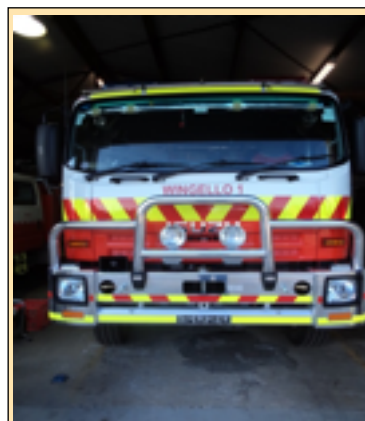
The latest member of the Wingello Rural Fire Brigade Team - Wingello 1

The Open Day in conjunction with Get Ready Week end for the brigades including Wingello will be held on the weekend of 12/13th of September. The brigade will have its usual Open Day on the Saturday and will include a giant slide for the kiddies, our BBQ, and demonstration on our training practices throughout the morning. The brigade will also have all crew members present and around the village during the course of this get ready Weekend. More information on this weekend will be available closer to the date. Keep this date in mind. The Get Ready Weekend is as it says - to have the brigades get more involved with their communities and be available to assist them in any way we can to help them prepare for the oncoming fire season. The general consensus is that it looks like a being a busy one. So Get Ready to stay safe