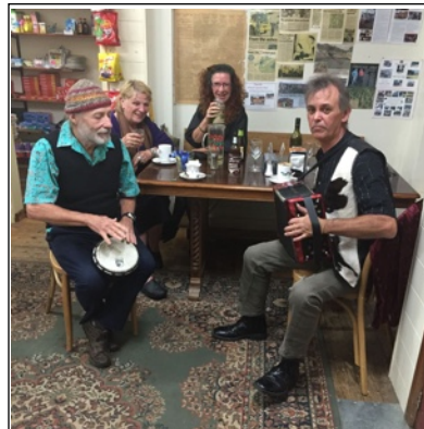
Locals bursting into music at the latest Chef Night Special