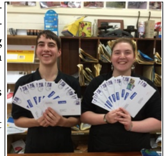
Helping a customer send lots of Overseas letters.

So support your local businesses so they can support you.